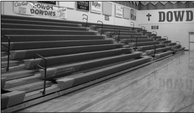
New bleachers were installed in the Dowd Activity Center funded by a lead gift in the SEF 14 fund drive. The old bleachers were dismantled and recycled by nearly 100 volunteers and Scotus received $2,816.10 for recycling the original bleacher metal.