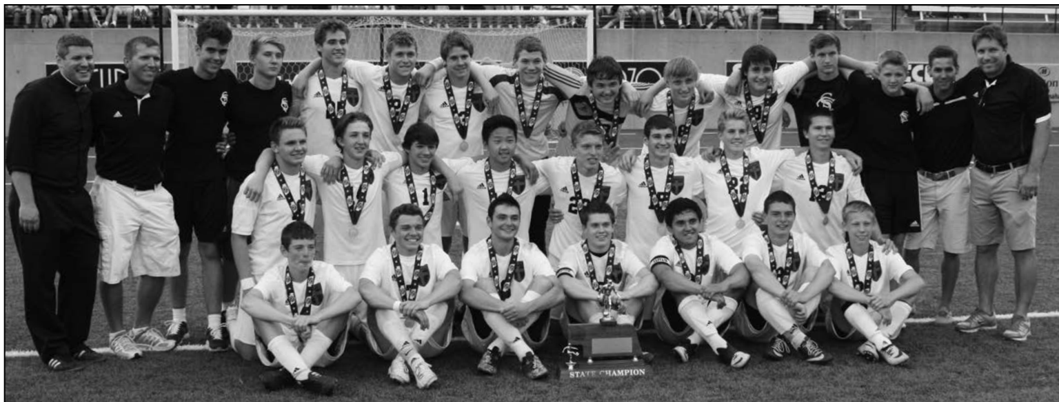
The 2014 Shamrock boys State champion soccer team.