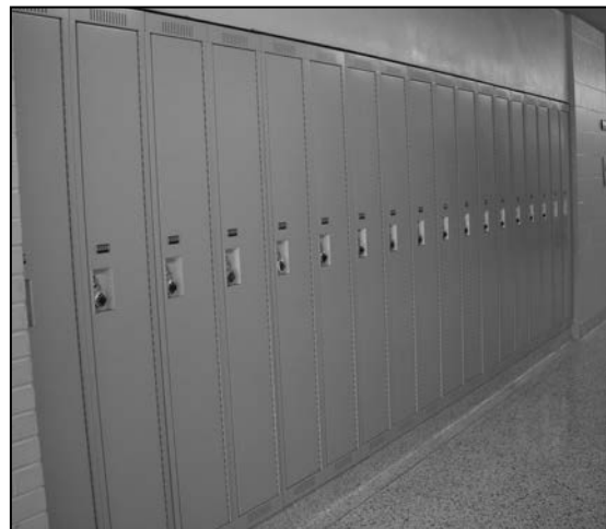
The half-size hall lockers for the junior high students were replaced in the summer of 2014 with new full-size lockers thanks to the generosity of Gala donors.