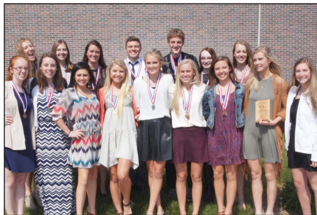
State Journalism contestants from Scotus.