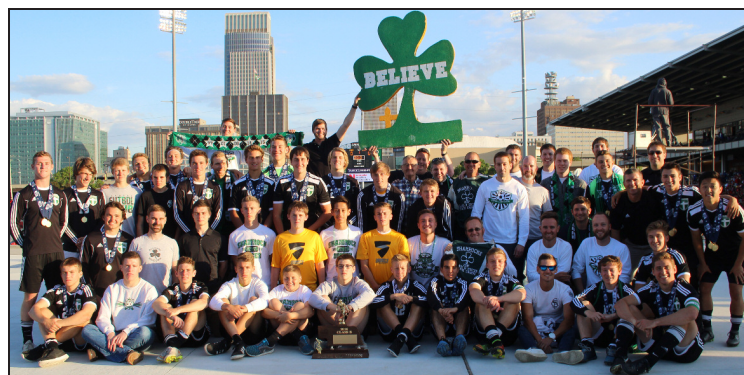
Three-Peat Class B Boys State Soccer Champions.