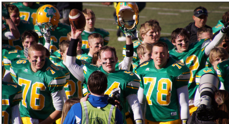
Class C-1 State Football Champions