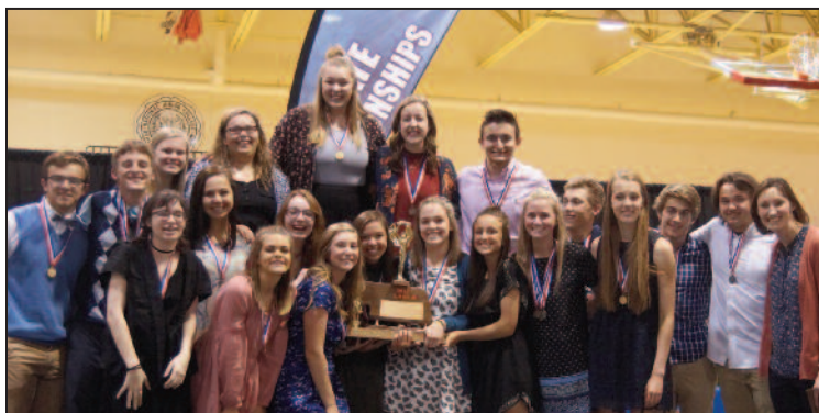
Journalism. Scotus won the state Class B title in Journalism for the first time in school history!