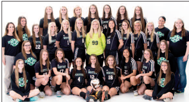
The girls' soccer team finished the 2017 season as state runner-up boasting a 16-3 record.