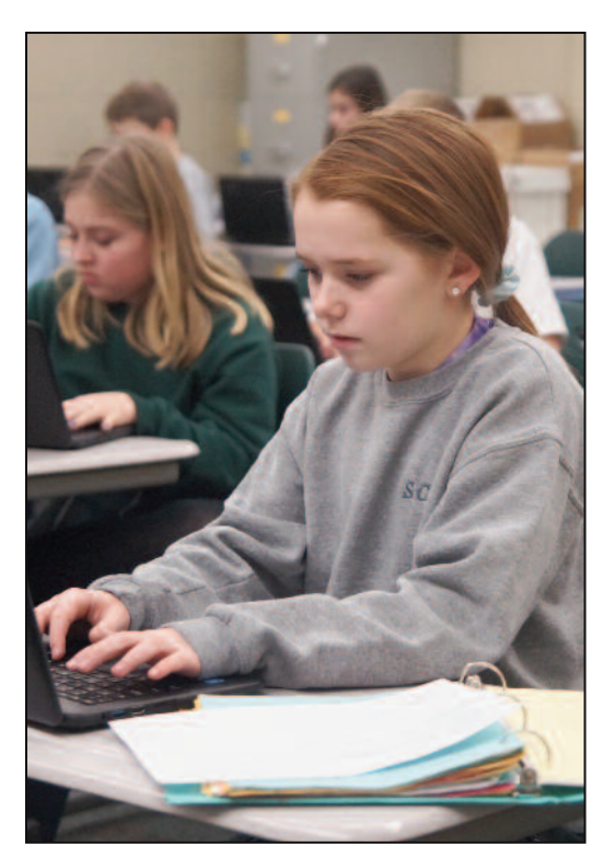
394 computers are available for Scotus' 350 students

assistance. 90 students received need-based tuition assistance. 44 Scotus students participated in the federal free (n=22) and reduced (n=22) lunch program compared with a total of 46 the previous year.