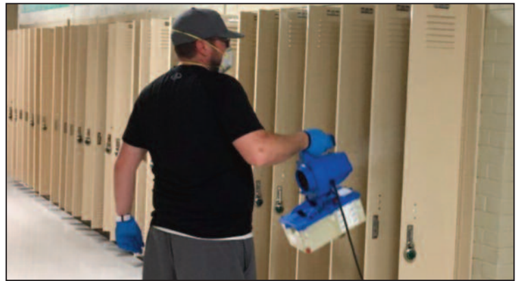
Fumigating the school became a common practice during the school year's fourth quarter and following summer due to the COVID-19 pandemic.