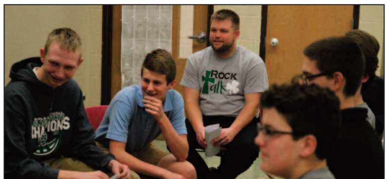
Rock talk study group discussing the week's Gospel message.