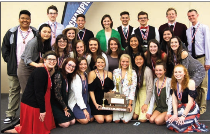
State Journalism Champions.