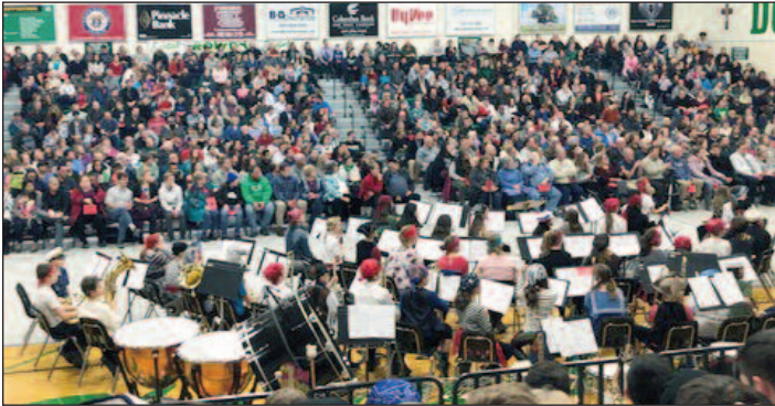
The concert following this year’s band dinner in January, packed the Dowd Center.