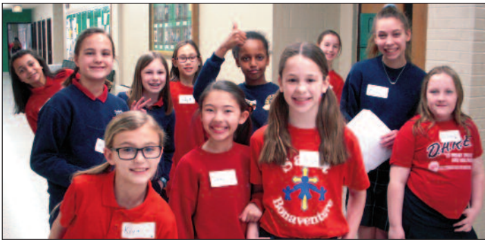
The 5th grade retreat took place at Scotus and it included a scavenger hunt to help the students get to know the layout of the school.