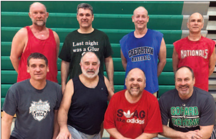
ALUMNI BASKETBALL "C" DIVISION CHAMPIONS