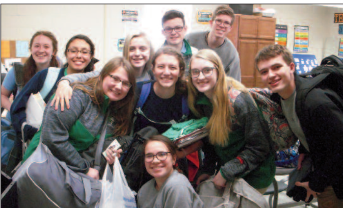
State Speech qualifiers