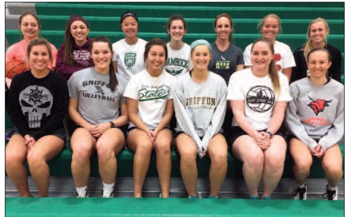
LADIES DIVISION PARTICIPANTS