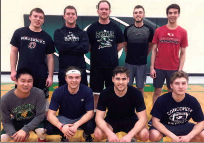
ALUMNI BASKETBALL "A" DIVISION CHAMPIONS