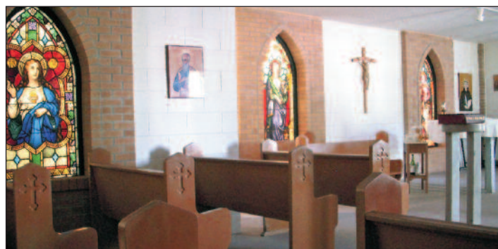
Chapel of the Immaculate Conception—see story on page 3