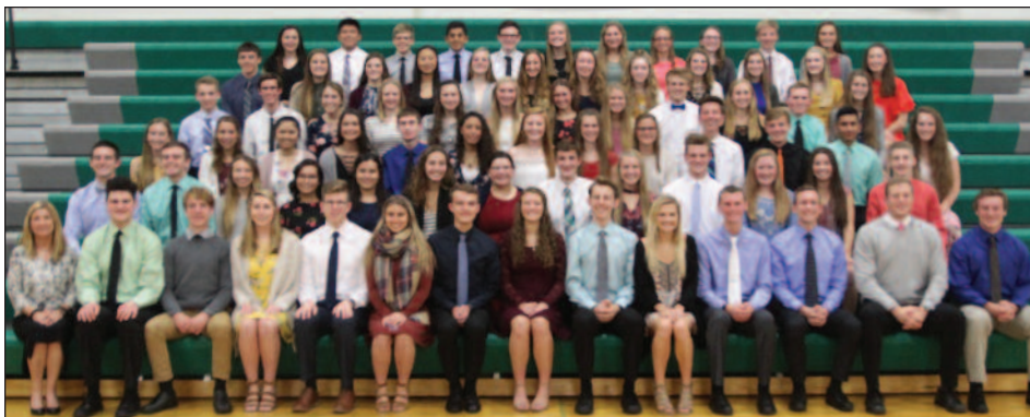
One junior and 28 sophomores were inducted last fall into the National Honor Society, bringing the Scotus membership total to 78 sophomores, juniors, and seniors.