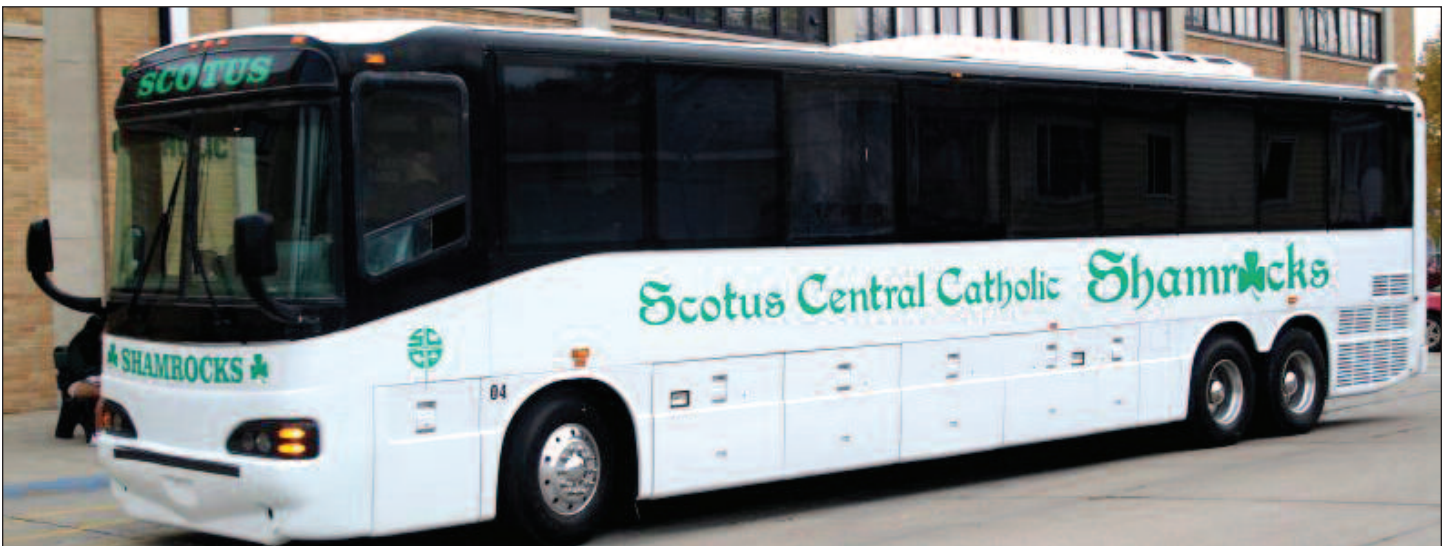
Last fall, Scotus was able to purchase a used coach bus for activity transportation at the same price level as a yellow school bus. Our students love it!

Nonprofit Organization U.S. Postage PAID Columbus, NE Permit No. 5