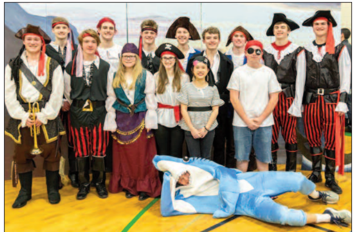
Playing to the band dinner/concert's theme, several students dressed in pirate attire.