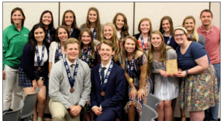
State Journalism Team