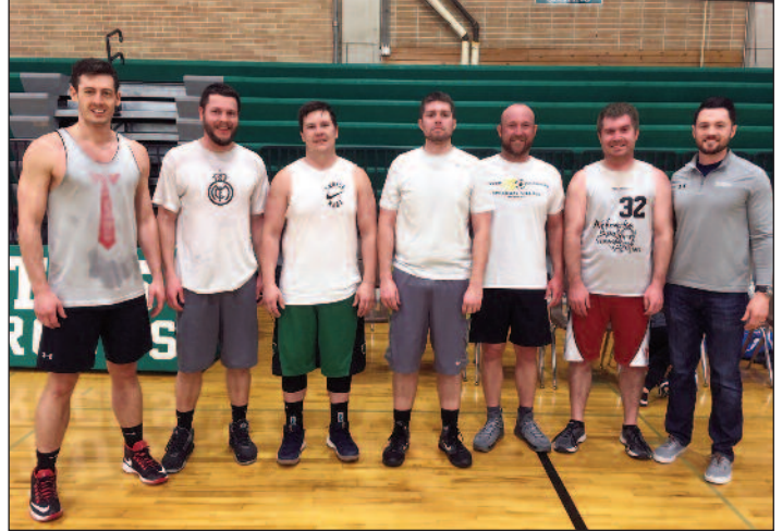
ALUMNI BASKETBALL "B" DIVISION CHAMPIONS