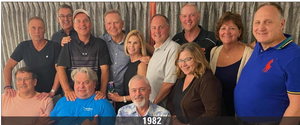
The Class of 1982 Celebrated an exciting destination 40th Class Reunion in Las Vegas!

The Class also accepted donations and held a silent auction of the donated items for the benefit of Scotus Central Catholic. The Class collected $1,600 that was given to Scotus to help buy new Stations of the Cross for the school's Chapel of the Immaculate Conception. Reunion organizers also wanted to share that Wunderlich's doesn't charge a rental fee for events. Thank you, Class of 1977!