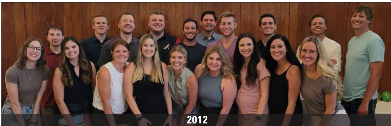
The Class of 2012 gathered for their 10th reunion in August enjoying time together, a tour of Scotus and Columbus Days.