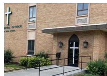
Chapel exterior entrance