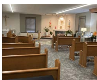
Chapel after renovations