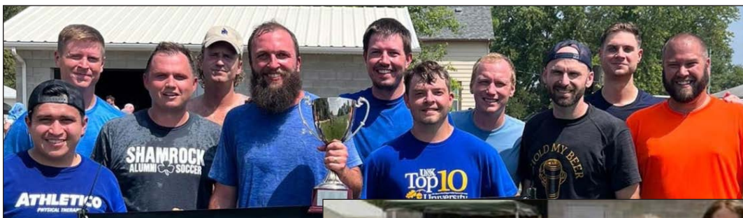
Gold Division Champions – Team 2007/2011/2012