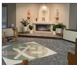
Chapel after renovations