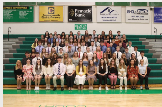
The 2023-2024 National Honor Society.

On Thursday, October 26, 2023, 31 new members were inducted into the Scotus Chapter of the National Honor Society at Scotus Central Catholic High School.