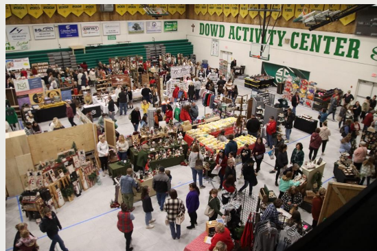
The 2023 Craft Boutique shopping area in the Dowd Activity Center.

One of the most successful fundraisers Scotus puts on every year is the Scotus Craft Boutique. The Boutique will be this Sunday, December 4th, and feature over 80 vendors.