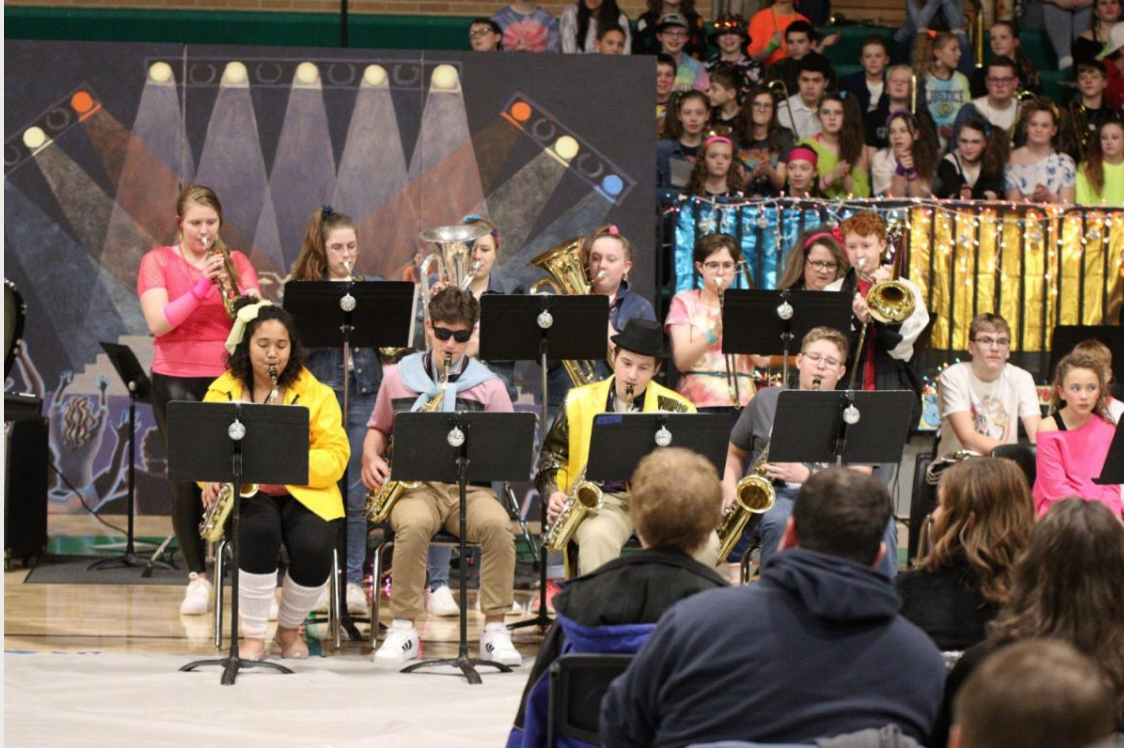
(Above) The band performs at the Band Dinner Concert last February.