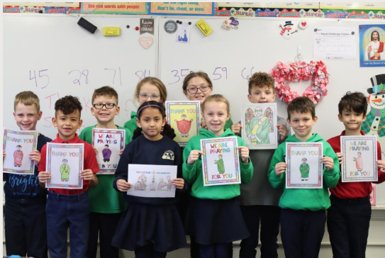
St. Anthony 2nd graders show off their photos they drew for priests, deacons and seminarians.

Scotus Central Catholic Facebook St. Anthony Elementary Facebook St. Bonaventure Elementary Facebook St. Isidore Elementary Facebook Scotus Central Catholic Twitter Columbus Catholic Schools YouTube Columbus Catholic Schools Instagram