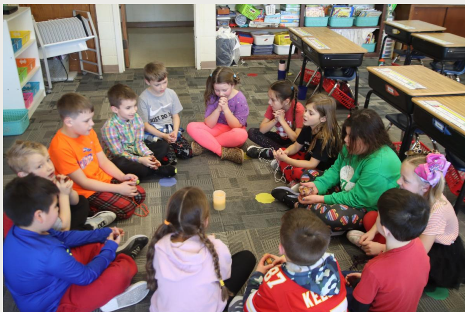
One of the St. Isidore 3rd grade classes prays before an activity.