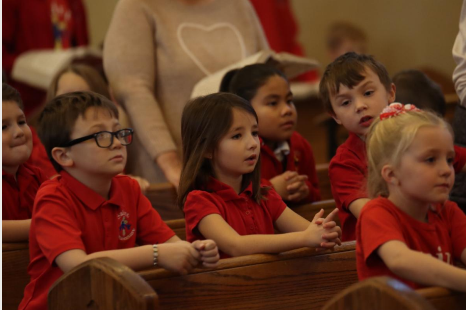
St. Bonaventure students praying during Mass.