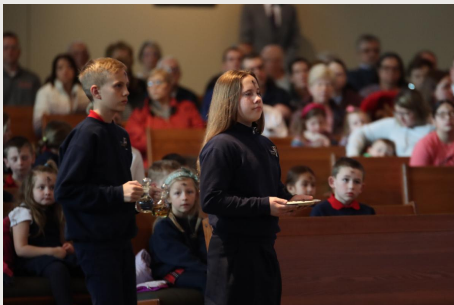
St. Isidore students prepare for communion.