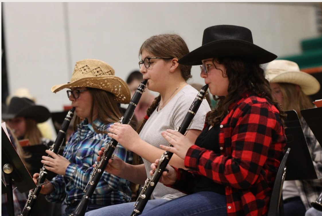
(Above) The band performs at the Band Dinner Concert last month.