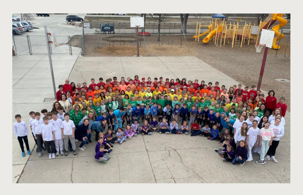
St. Bonaventure students celebrated literacy spirit week and wore the colors of the rainbow in remembrance of God's promise to Noah on March 14th.