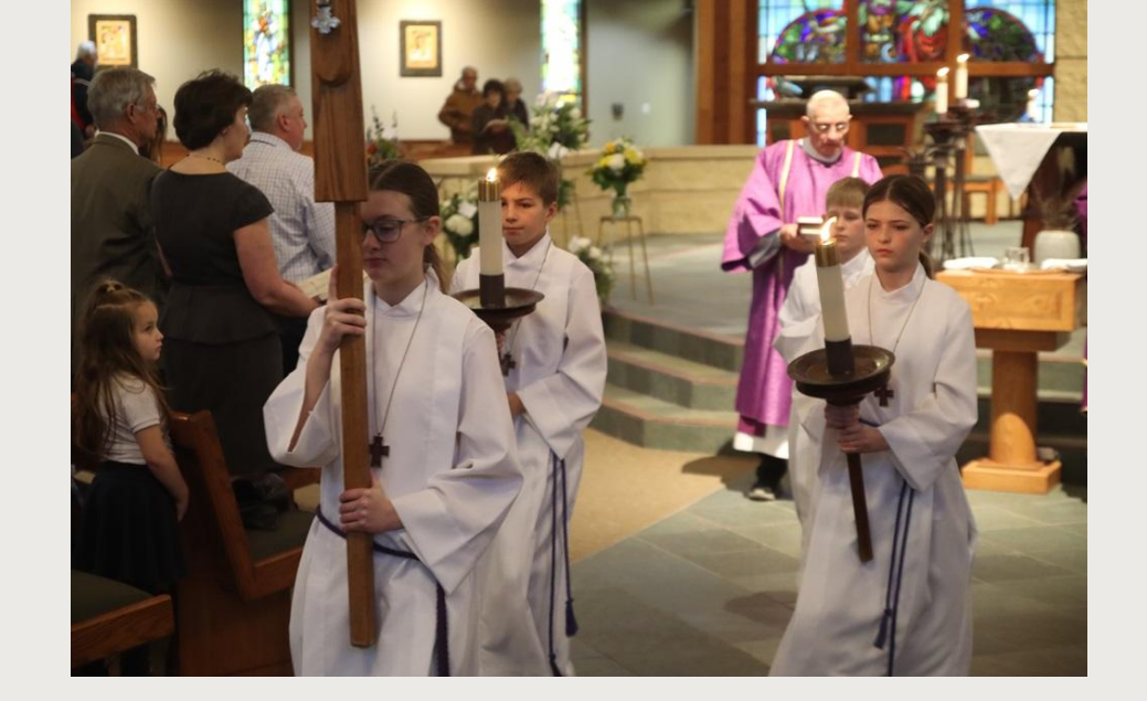
St. Isidore students at Mass on March 22nd.