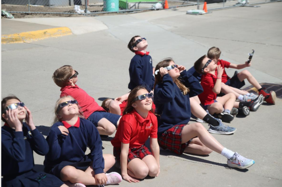
St. Isidore students enjoy the partial eclipse in the parking lot.