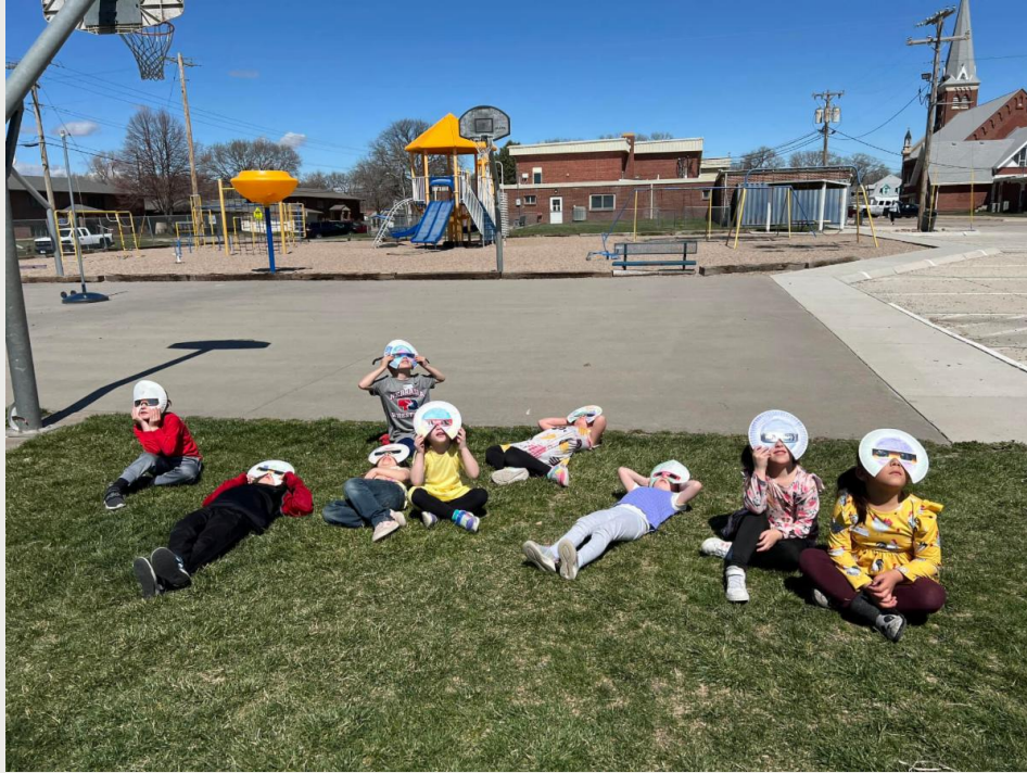
St. Anthony students students enjoy the partial eclipse on the playground.