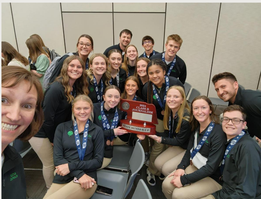
Scotus Central Catholic students pose with the NSAA Class B State Runner-Up trophy after the state journalism contest.

CLICK HERE TO DOWNLOAD THE MAY LUNCH MENU