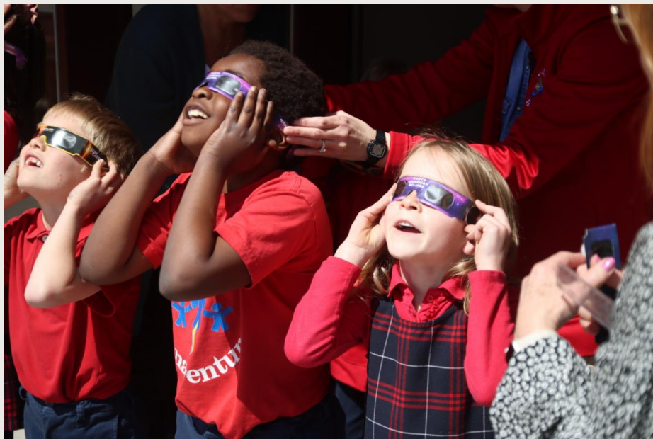
St. Bonaventure students enjoy the partial eclipse.